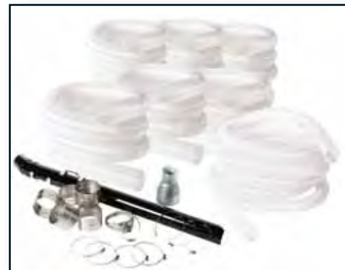
200' or 150' hose package