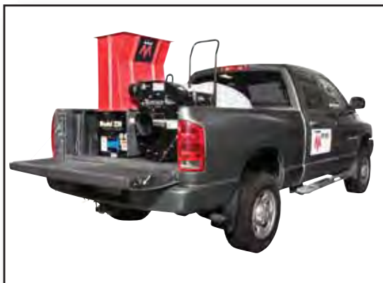
Easily loaded in truck or van