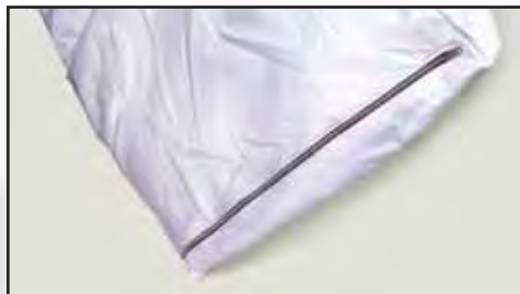
Disposable bags for additional profit