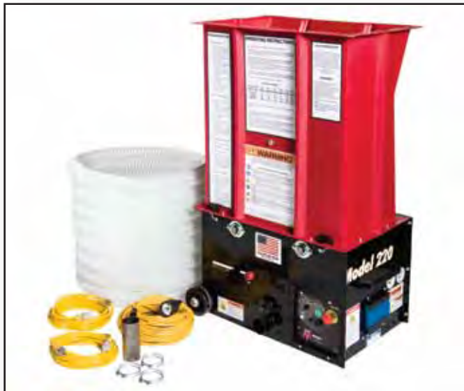
Typical 220 accessory package