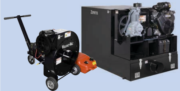
Veloci-Vac with 20HP Kohler Engine and 12 volt electric start