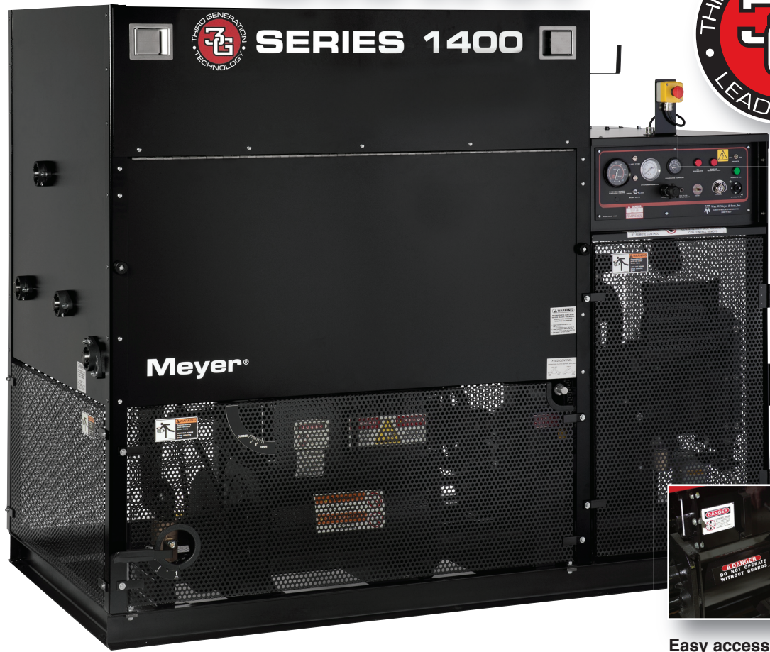
Easy access, front seal change-out door