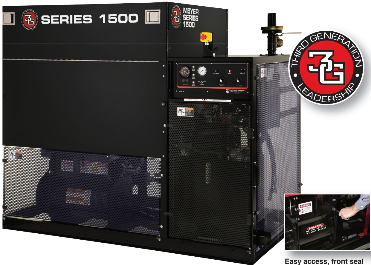
Easy access, front seal change-out door