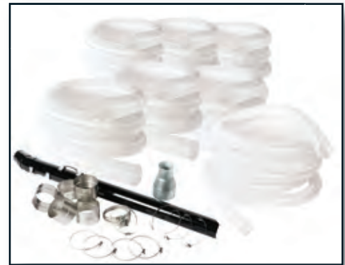
200' or 150' hose package