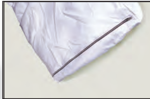
Disposable bags for additional profit