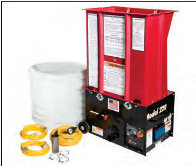
Typical 220 accessory package