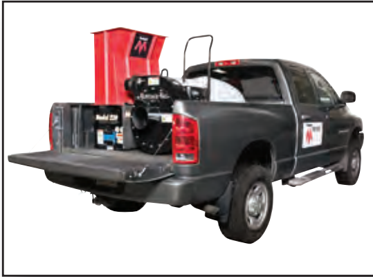
Easily loaded in truck or van