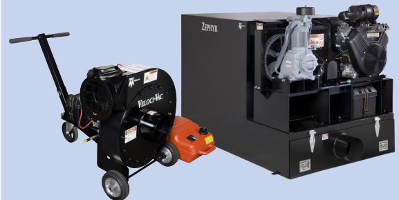
Veloci-Vac with 20HP Kohler Engine and 12 volt electric start